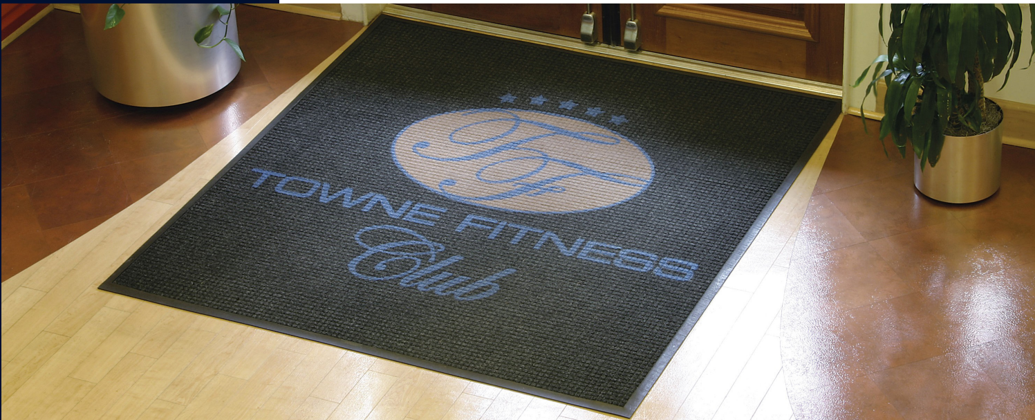
Product No. 234 (classic border), 235 (fashion border) 3/8" thickness

Logo • Scraper/Wiper Mats • Indoor/Outdoor